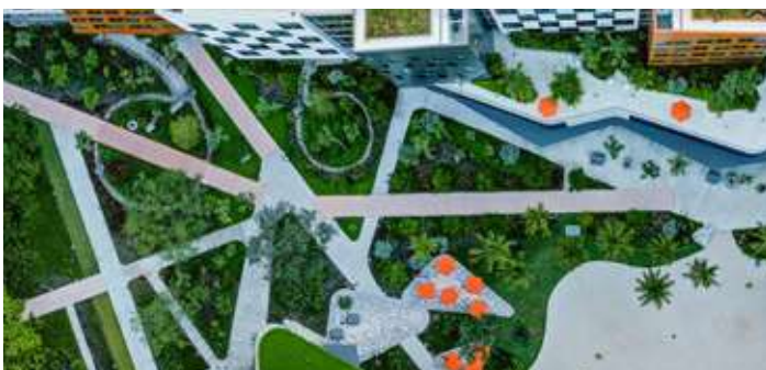
UNIVERSITY OF MIAMI LAKESIDE VILLAGE