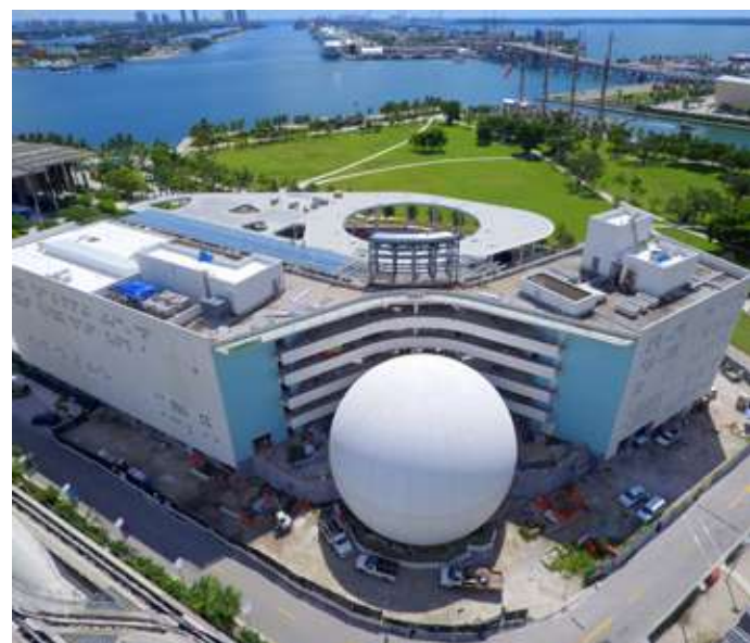
FROST SCIENCE MUSEUM