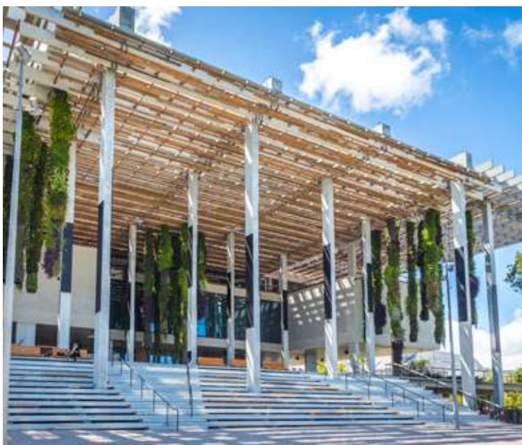
PÉREZ ART MUSEUM MIAMI