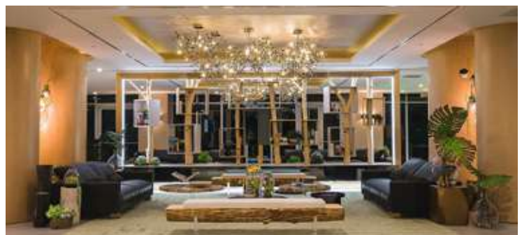
ARIA ON THE BAY