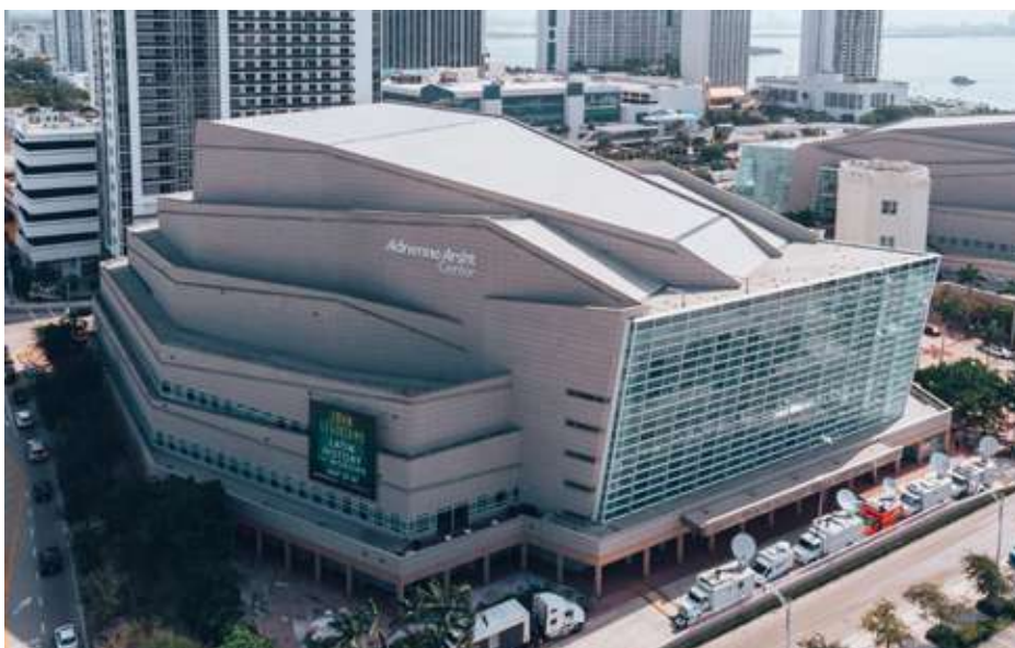
ADRIENNE ARSHT CENTER FOR THE PERFORMING ARTS OF MIAMI

A pair of glass towers with flowing design profiles rises high above Miami's chic Edgewater neighborhood. Directly on the shores of Biscayne Bay and surrounded the bustling Downtown and Brickell city centers, Design District, Wynwood, Midtown, and Miami Beach. Aria Reserve is immediately recognizable, yet feels like a private estate hidden away from the rest of the world.