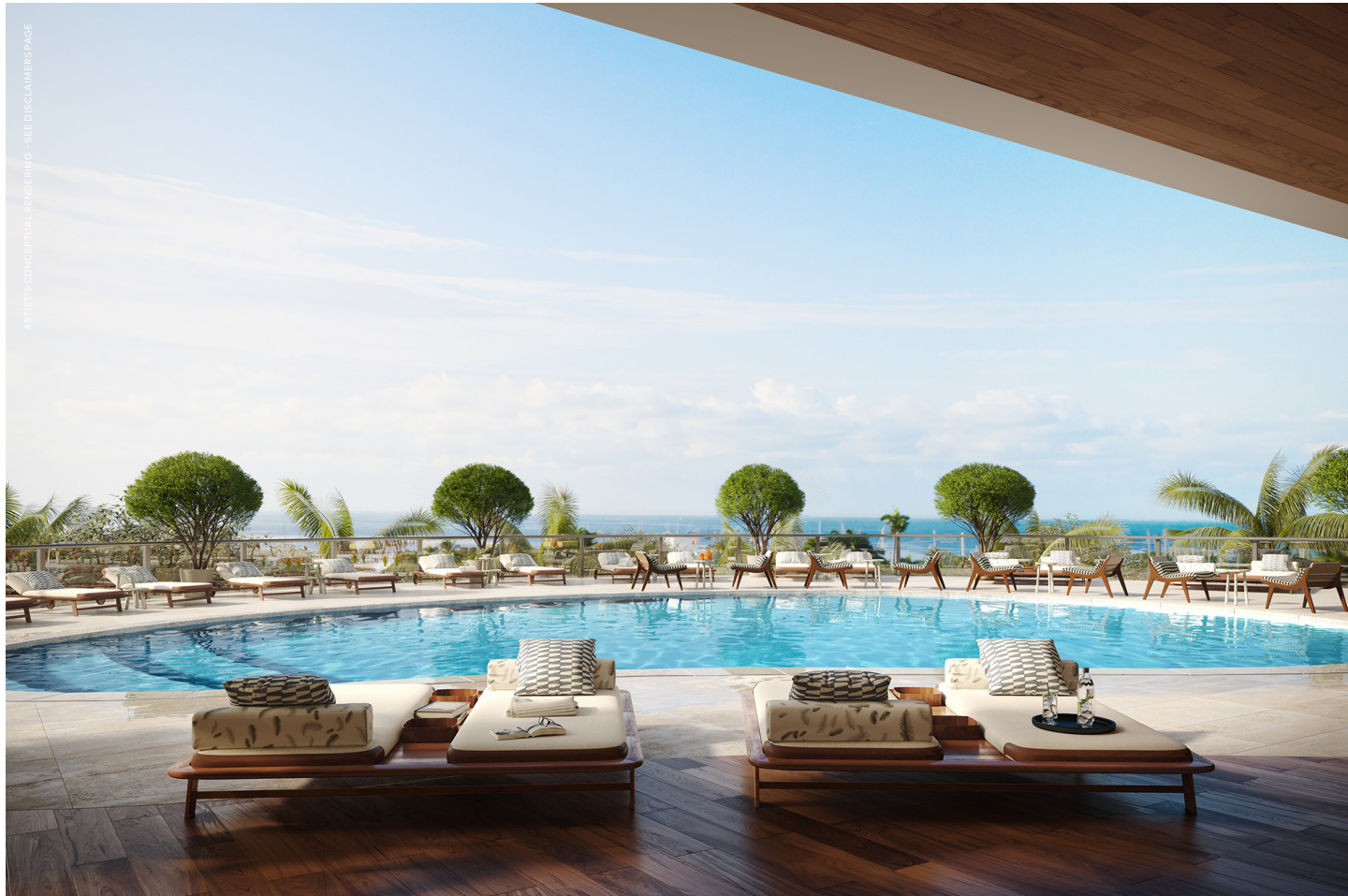
Bayshore Club Pool Deck

Personalized services, including a 24-hour concierge, are complemented by a host of amenities at Mr. C Residences Coconut Grove.