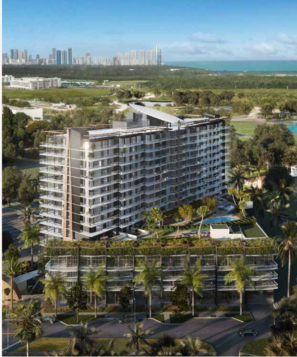
NEXO RESIDENCES IN NORTH MIAMI BEACH, FLORIDA