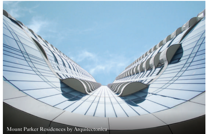
Mount Parker Residences by Arquitectonica