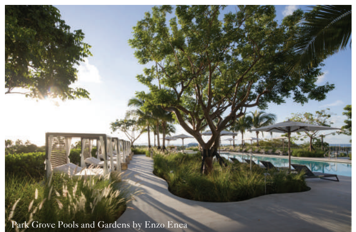
Park Grove Pools and Gardens by Enzo Enea