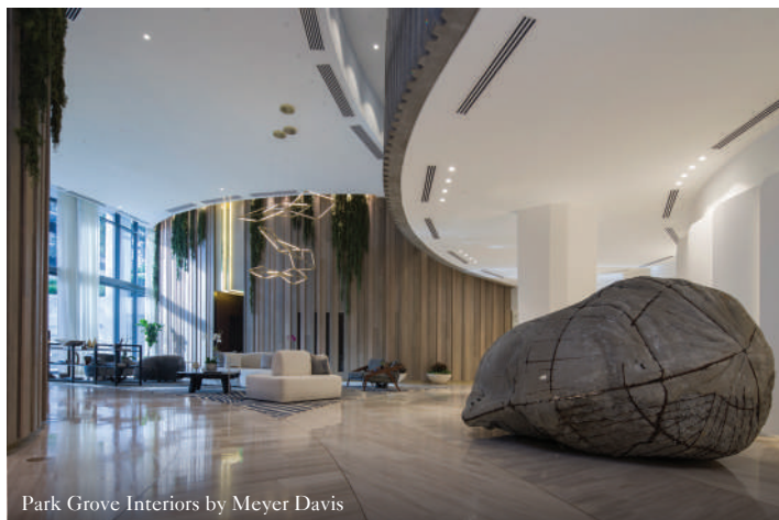
Park Grove Interiors by Meyer Davis