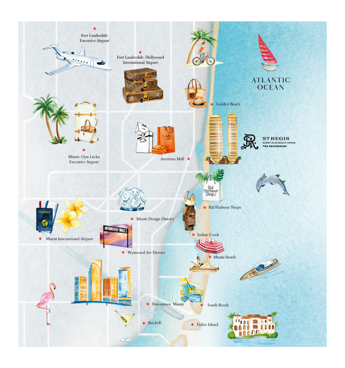
Sunny Isles Beach, FL 33160